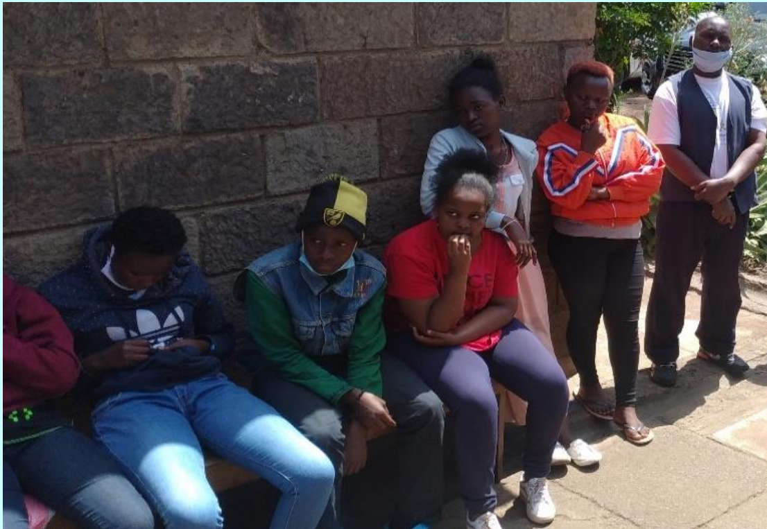
Photo 16: Beneficiaries awaiting to receive their Christmas packages