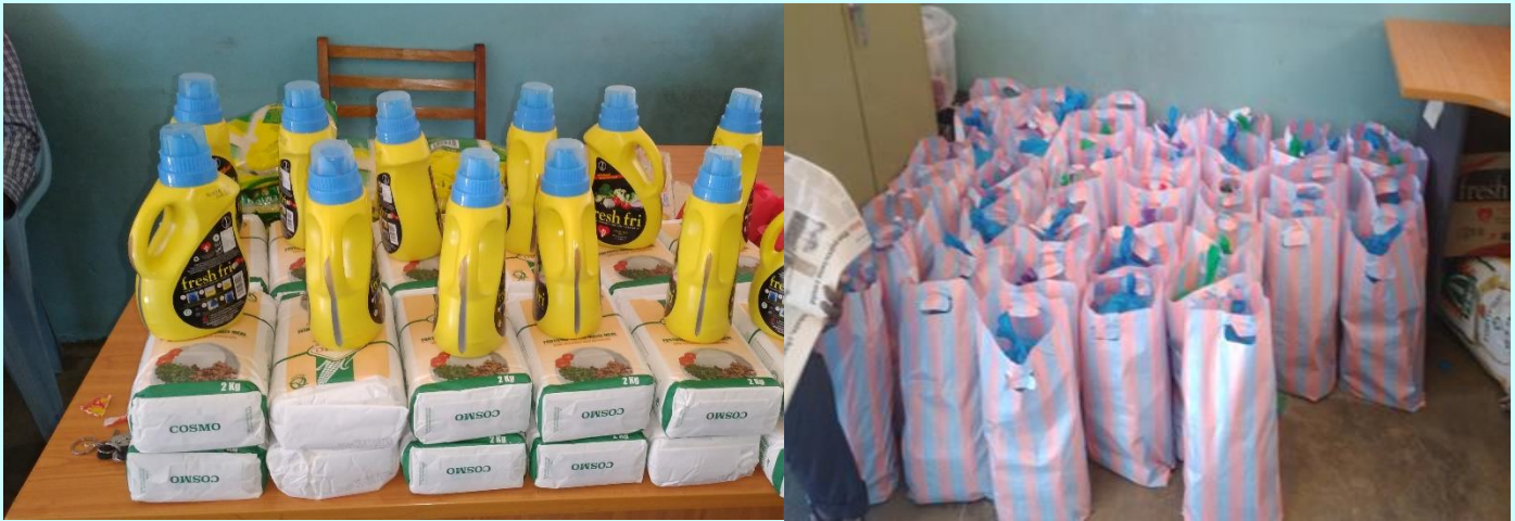
Photo 13: Christmas package offered to Valter Baldaccini Foundation beneficiaries