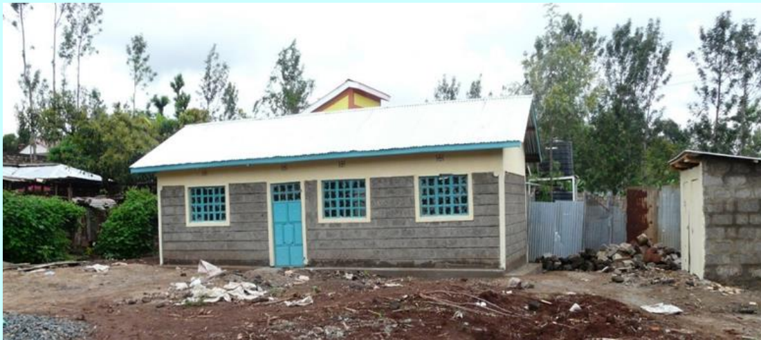
Photo 8: Miriam Mugure's new residence in the village constructed by KTSSC partners 2020