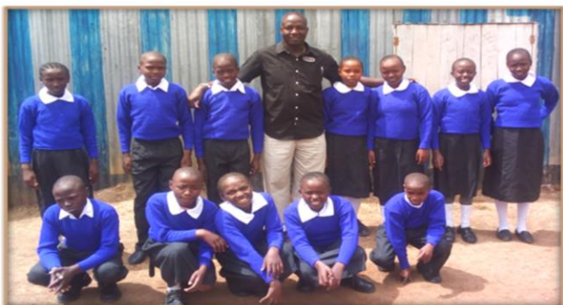
KTSSC staff with the beneficiaries after receiving new uniforms

The Mathare slum lacks formal schools and it is dotted with many ramshackle private schools that are mainly baby care centers to allow the mothers go seek for money by doing laundry. Infrastructure to implement what is called free primary education that is offered by the