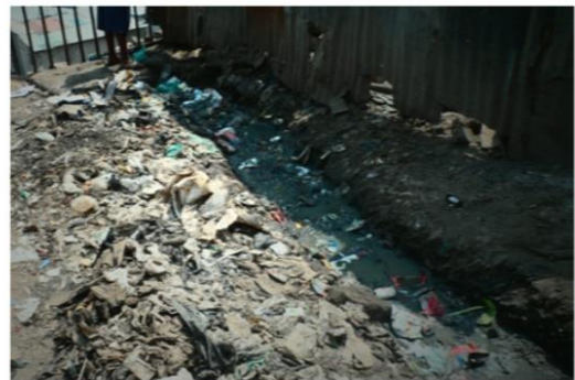
Poor sewerage and water drainage

Today Valter Baldaccini Foundation is the main sponsor of our education program. They have supported the program through sponsorship of boys and girls identified by KenToledo & Missionary Sisters of De Facuald as deserving. KTSSC does not work alone in their selection of the needy cases to support. We work hand in hand with the Missionary Sisters of De Facuald who deal with the sick in Mathare. From their interaction with the sick they are able to sieve through cases that are most needy.