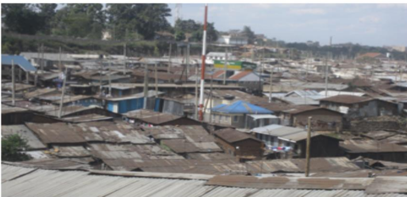
Mathare slums, KTSSC's area of operation

want to venture in the neighboring city estates find cheap housing here either by squatting with a friend or relative and or paying daily rates to landlord until they can afford a monthly rent. The risk of fire is too high in this area and the intervals of fires burning the houses increases with the landlords wanting to evict