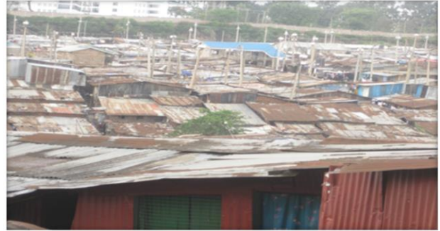
Aerial View of Mathare slums, Kenya

support to the education support program that is running up to now.