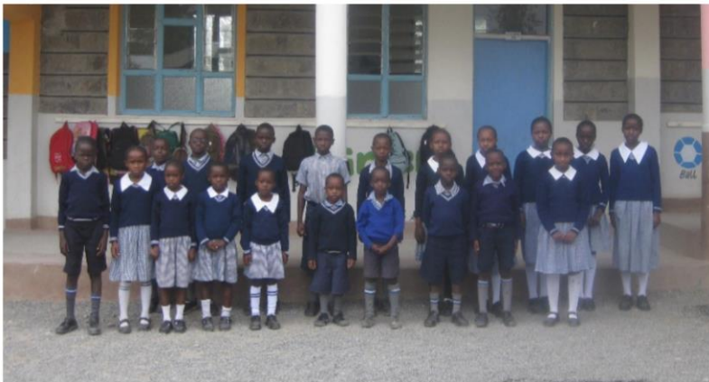
Some of the beneficiaries of the program during a school visit

There have been efforts to keep all the children going in school, but the basic needs that should spur their interest in school have been lacking even with the middle class of Nairobi struggling with such needs. The joblessness of the Mathare single mother, and the harsh conditions that they live in with some affected with the scourge of HIV Aids, makes the situation worse.