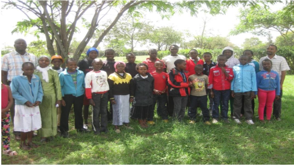
Valter Baldaccini Foundation beneficiaries during a counselling session at

For more than a decade now KenToledo Social Service Club has been in operation serving the needy of Mathare slums of Nairobi. The idea was borne out of the scripture “whatever you do to this little one you do it unto me” and the fact that the situation in the slums was dire and