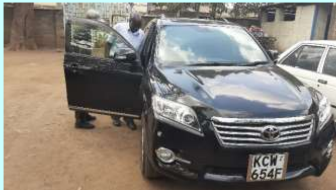
New Toyota Vanguard for the KTSSC Project sponsored by MIVA Austria

In September 2019, with the help of MIVA Austria, KenToledo acquired a Toyota Vanguard which has greatly eased the monitoring and Evaluation Process of KTSSC's Projects.