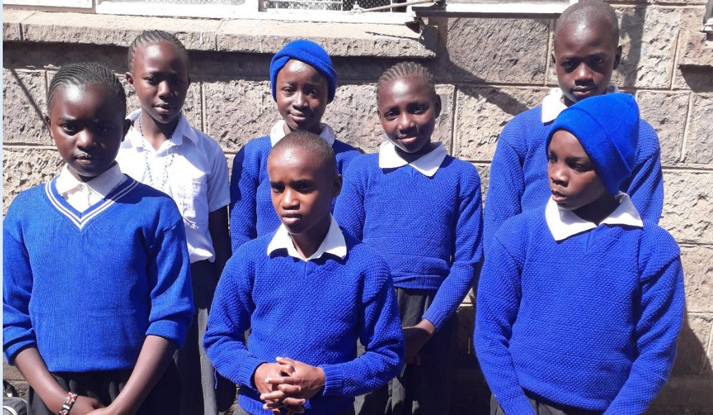
Some of pupils under KenToledo Social Service Club's care

K enToledo Social Service Club (KTSSC) is a light in the darkness for Mathare slum dwellers. The organization has initiated and managed various projects since its inception. Its initial project, which is running, is an education support program.