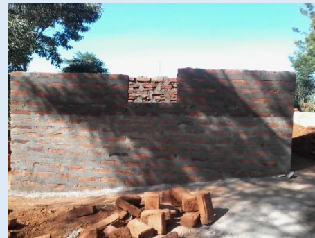
Kitui House Project Progress