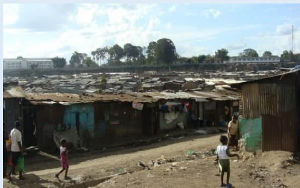
Mathare slums, Nairobi

K enToledo Social Service Club (KTSSC) is a light in the darkness for Mathare slum dwellers. The organization has initiated and managed various projects since its inception. Its initial project, which is running, is an education support program.