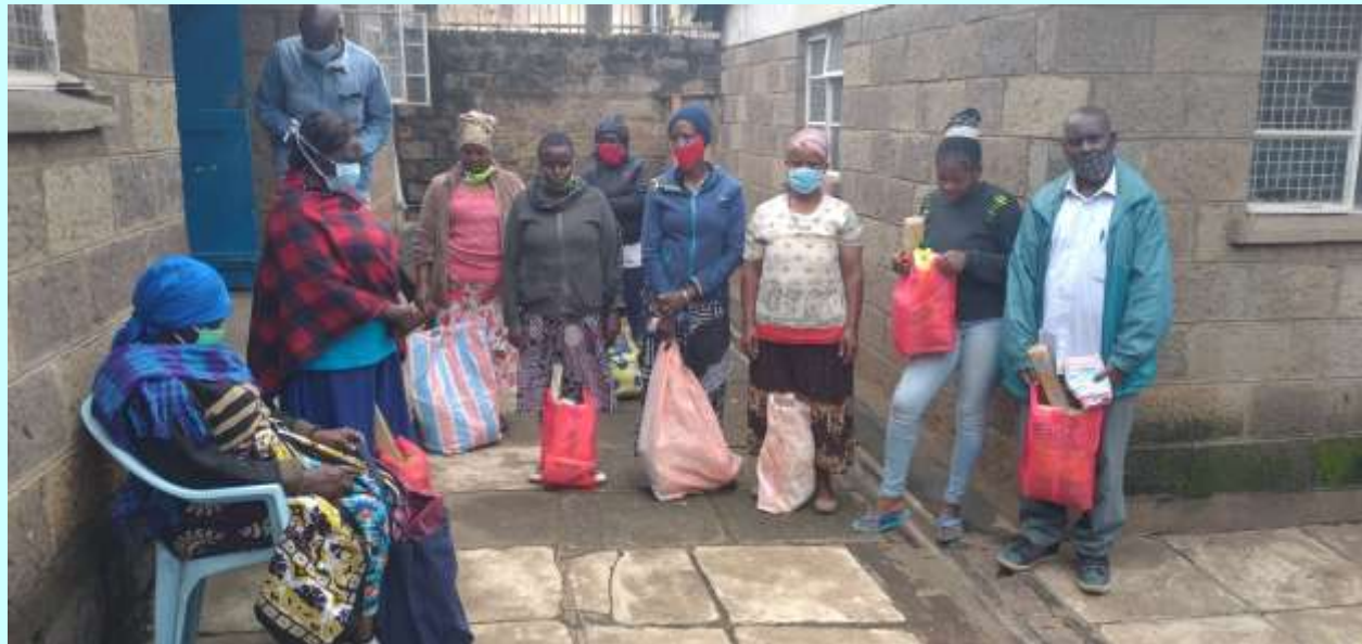
Parents after receiving food donations