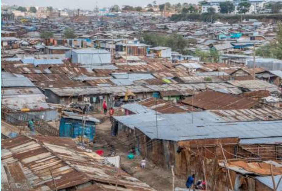
Aerial View of Mathare Slums, Kenya