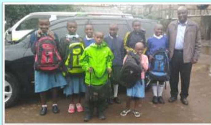
Children ready to go to school for the January – April semester