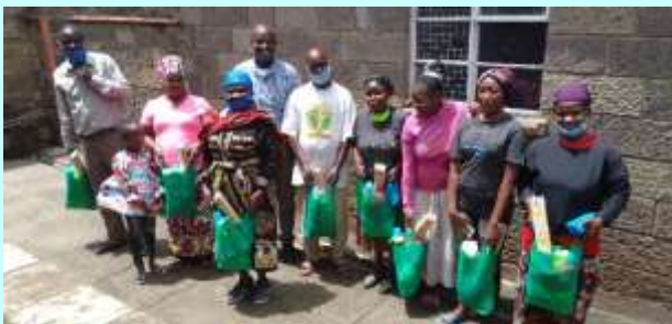
Beneficiaries happily pause for a photo after receiving food donations.