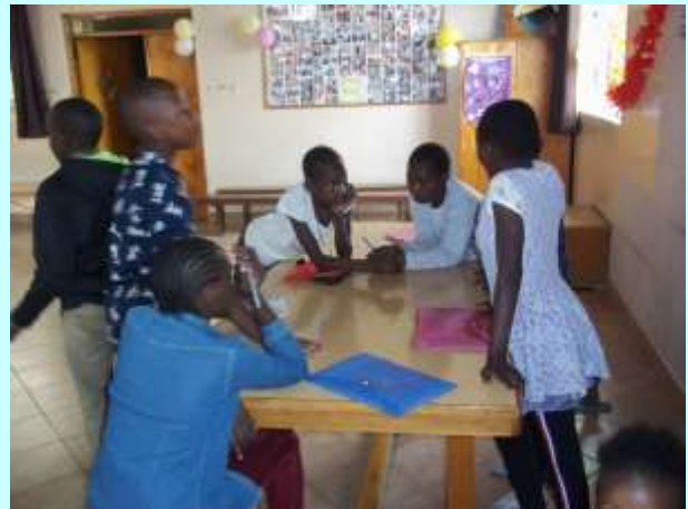
Some of the Beneficiaries during a TeenStar Training 2019 and they having a group discussion during a TeenStar Training 2019