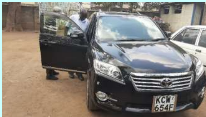
New Toyota Vanguard for the KTSSC Project sponsored by MIVA Austria

In September 2019, with the help of MIVA Austria, KenToledo acquired a Toyota Vanguard which has greatly eased the monitoring and Evaluation Process of KTSSC's Projects.