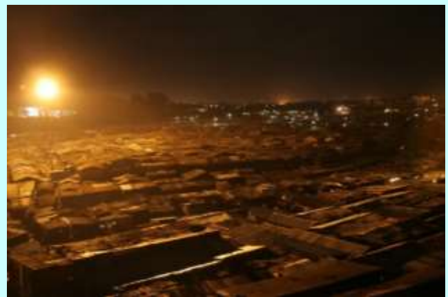
The Mathare Slums of Kenya in the day and in the night