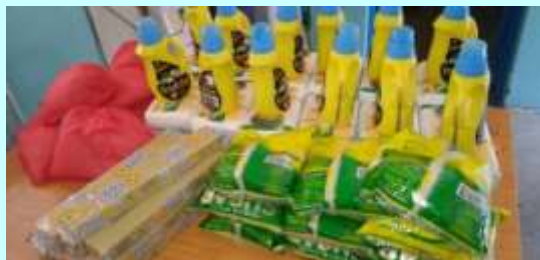
Food donation day 1

KTSSC is greatly grateful to all the well-wishers who have chipped in by donating food stuffs to our office for distribution to the needy slum dwellers. See the photos below.