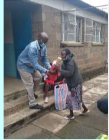
KTSSC Director handing over packaged food stuffs to the needy Mathare slum dwellers