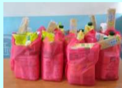
Food stuffs packaged for day 2 Distribution