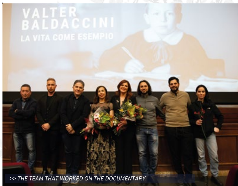
>> THE TEAM THAT WORKED ON THE DOCUMENTARY

Premiering on May 9, 2025, on the tenth anniversary of the Foundation that bears his name, the documentary film moved and thrilled the 600 people who filled the Sala Rossa of the Politeama Clarici Multisala in Foligno.