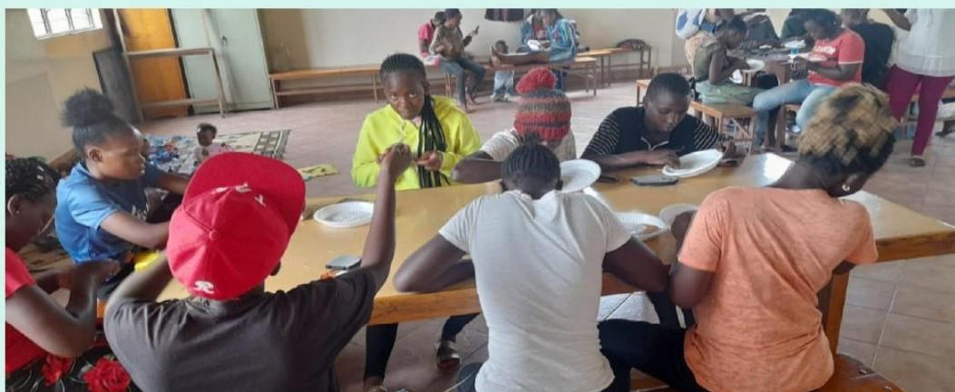
Photo 19: Teen mums 22/23 group during handcraft training in beadworks