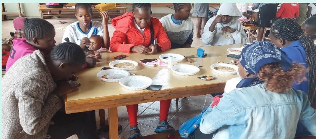
Photo 17: Teen mums 22/23 group during handcraft training in beadworks