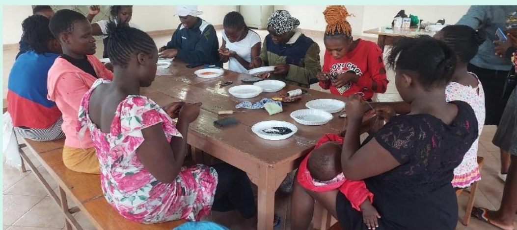
Photo 18: Teen mums 22/23 group during handcraft training in beadworks